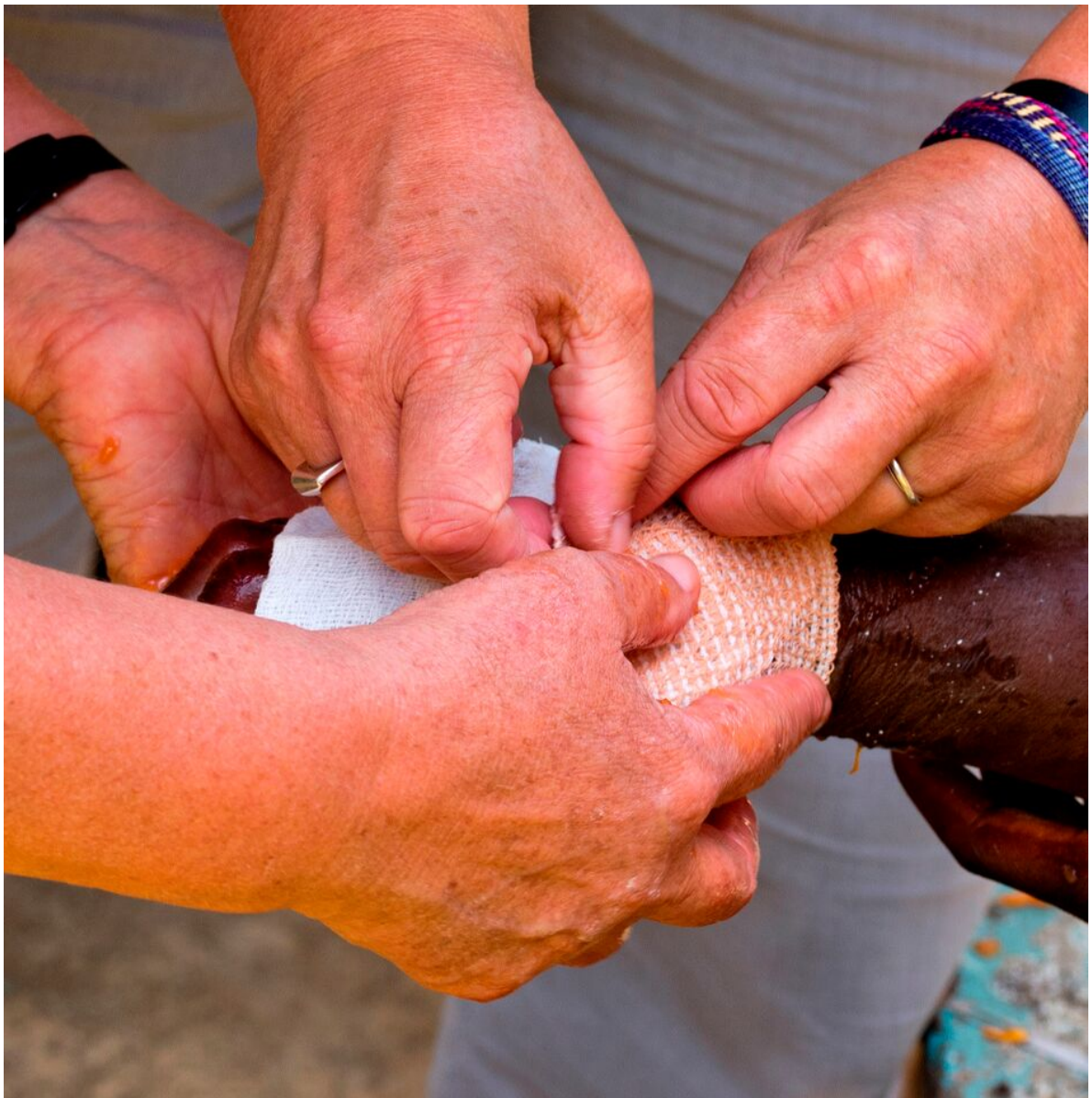
Multi-sectorial collaboration for the ones in need / © Marten Brill