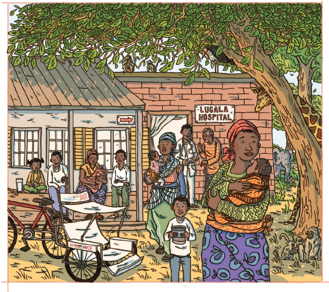
The Lugala Hospital in Tanzania; Illustration: Anna-Lea Guarisco