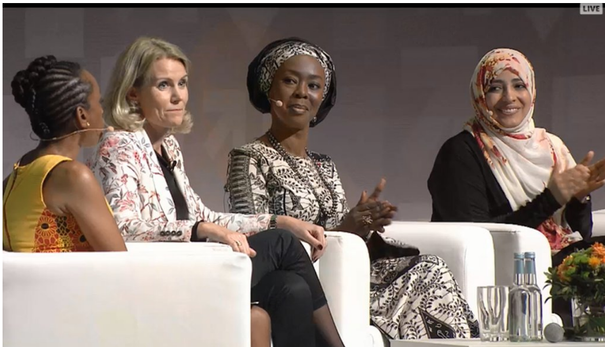
World Deliver Conference 2016

This requires political will and a system in place for the regulation and licensing of professional midwives, a sufficient number of accredited teaching institutions to deliver high quality midwifery education, training and supportive supervision, and internationally binding accreditation guidelines – as currently developed by the International Confederation of Midwives – are all urgently needed. The lack of qualified midwifery teachers, mentors and role models as well as the willingness of donors to invest in teaching and other initiatives such as midwife-led service units poses a grave challenge for the success of SDG3.