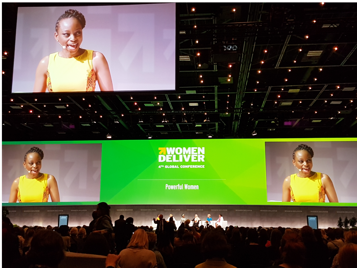
World Deliver Conference 2016

Jill Sheffield, a global advocate for maternal, sexual and reproductive health and rights, launched in 2007 the first Women Deliver Conference - which evolved into an international advocacy organization aimed at generating the much needed political will and investment to meet MDG 5 by 2015.