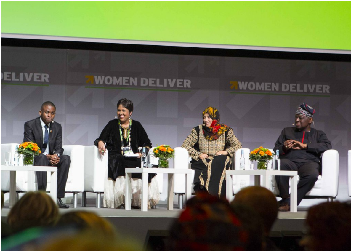
World Deliver Conference 2016