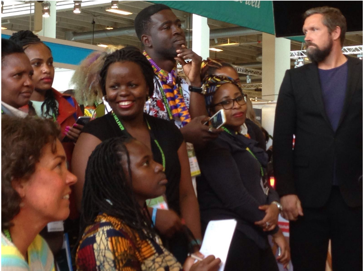
World Deliver Conference 2016